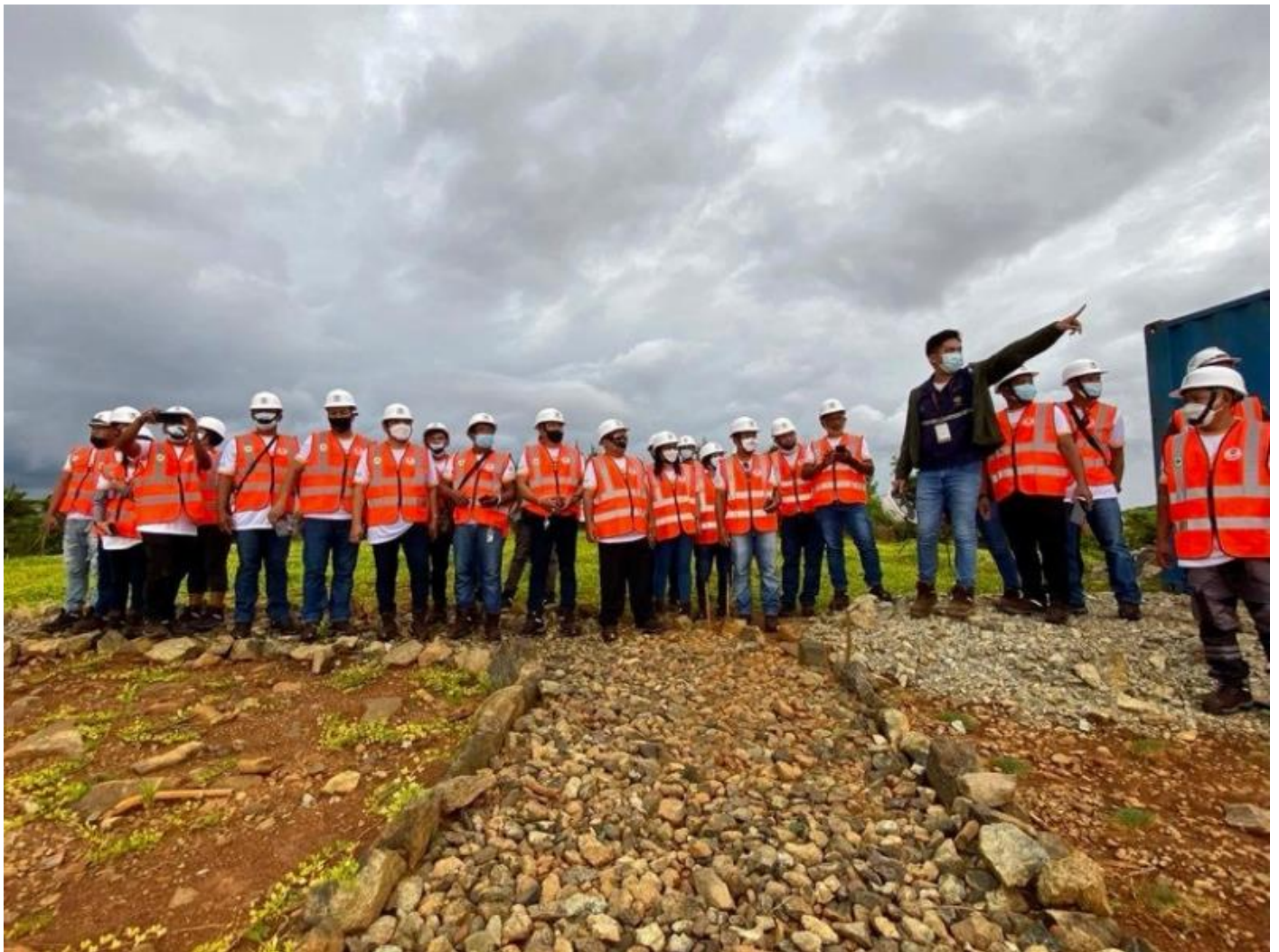
Barangay Captains and Kagawads of Guiuan, Eastern Samar, direct their questions about mining to experts at the mine sites

BMPlus · June 28, 2022 · 409 views · 2 minute read